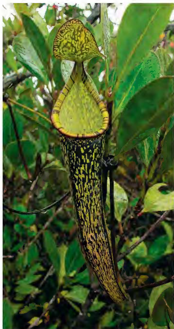
Figure 3: An upper pitcher of a plant growing on Mount Tahan that matches Ridley's description of N. gracillima – note the morphological differences with the upper pitchers of N. alba .

Nepenthes gracillima derives its name from the Latin gracillimus (slenderest or slimmest), which refers to the shape of the upper pitchers (see Figure 3). Nepenthes gracillima is currently known only from the upper slopes of Mount Tahan, and it seems to be much rarer than N. alba . All known populations (as well as my observations) are recorded amidst upper montane scrub on humid ridge tops between 1600-1700 m (5250-5577 ft) altitude. Nepenthes gracillima is not widespread or populous on Mount Tahan, and the populations I observed consisted of just a few dozen plants (but these are consistent and uniform).